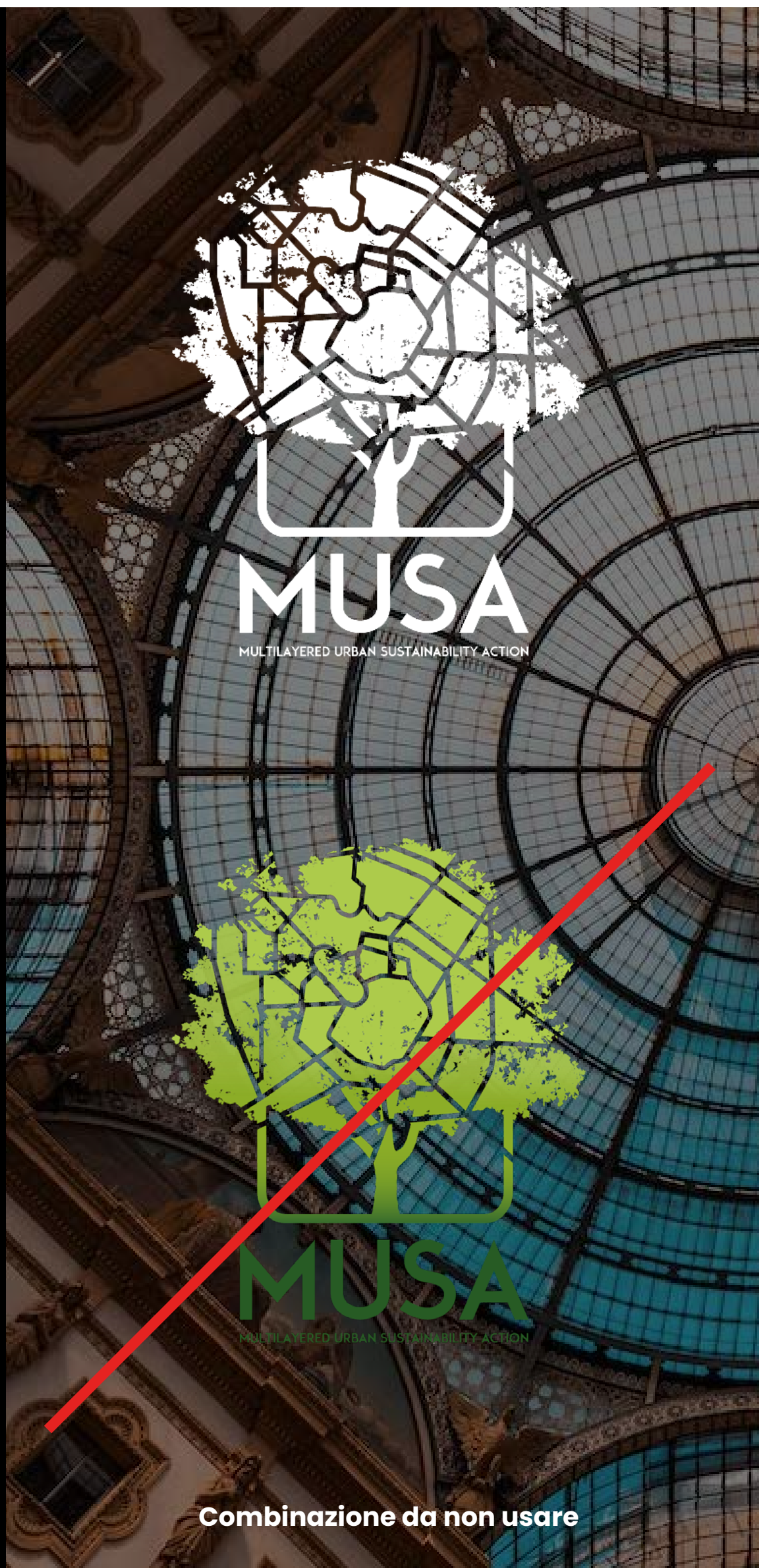
Combinazione da non usare