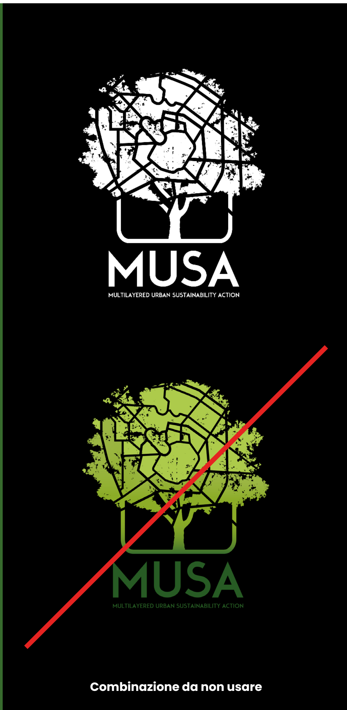
Combinazione da non usare